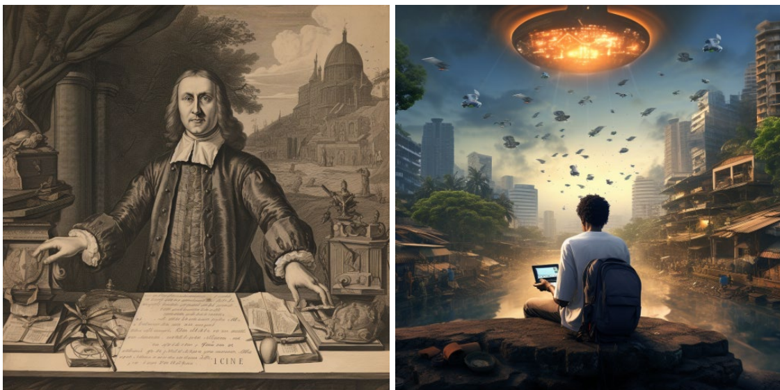
From left: Right to Information as Anders Chydenius' concept in 1766, versus an intergalactic RTI request being filed in 2066, as imagined by MidJourney

In 1766, 200 years before the U.S. Freedom of Information Act (FOIA) was enacted, a Finnish priest named Anders Chydenius from the small city of Alaveteli was probably the first to put into writing a principle that, today, is the backbone of one of the most important tools in modern journalism.